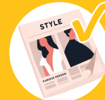
Magazines and flyers (remove plastic sleeves and wraps or strapping)