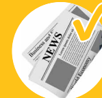
Newspapers (unroll and remove plastic sleeves and wraps)