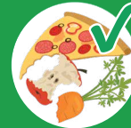
Food scraps raw and cooked