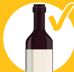
Bottles emptied and lids removed