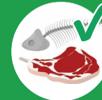
Meat, seafood, bones, raw and cooked