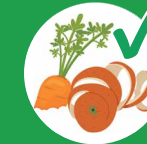
Vegetable and fruit peelings