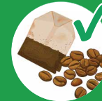
Tea bags and coffee grounds