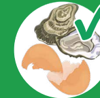
Egg and oyster shells