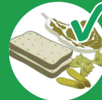
Expired and mouldy food (depackaged)