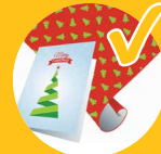
Wrapping paper and cards