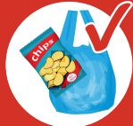
Soft plastic bags, cask bladders and wrappers

Residents can drop some soft plastic items to collection points at Brighton Civic Centre and Glenelg North Community Centre.