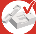
Polystyrene, styrofoam containers, foam trays