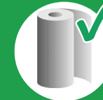
Paper towel and tissues