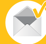
Envelopes and letters