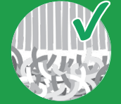
Shredded paper (loose not bagged)