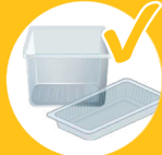
Punnets and biscuit trays