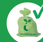
Compostable dog tidy bag