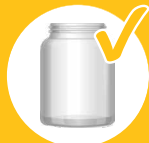
Jars emptied and lids removed