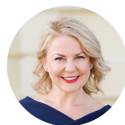
Amanda Wilson Mayor City of Holdfast Bay

The 7.1% increase in rates comprises 4.8% which aligns with Adelaide CPI (as at December 2023) to fund the full range of council services along with a 2.3% increase for the Transforming Jetty Road project. More information can be found within this summary document.