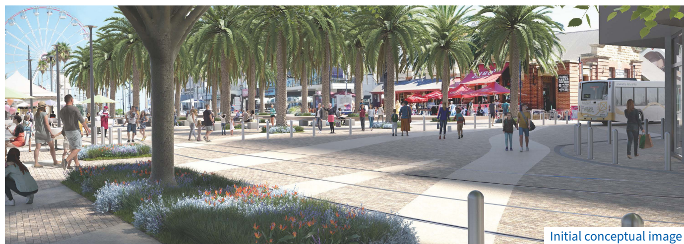
Initial conceptual image